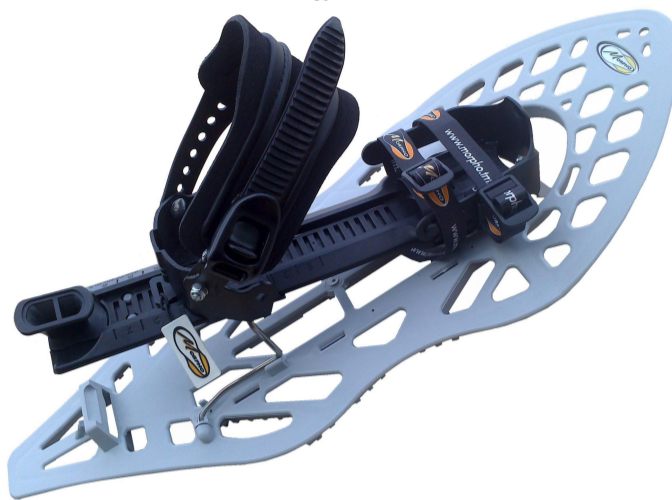
REF. 13MHRAQVSA Fig. 1

MORPHOALP Snowshoe People between 60 and 96 kgs, UNISEX ALPINE SLOPES, ALL TERRAINS www.morpho.tm.fr