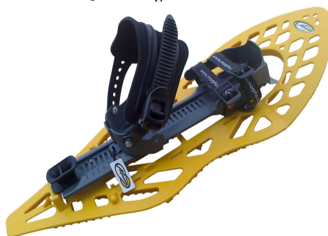
REF. 13MHRAQVS Fig. 1

MORPHO VIP Snowshoe People between 60 and 96 kgs, UNISEX ALL TERRAINS, FREERIDE www.morpho.tm.fr