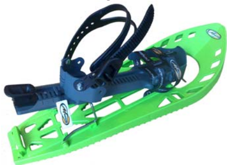
REF. 13MHRAQLAC Fig. 1

TRIMMYALP LIGHT© Snowshoe People weight up to 64kgs, UNISEX and KIDS ALPINE SLOPES, FREERIDE, ALL terrains, BACKCOUNTRY www.morpho.tm.fr