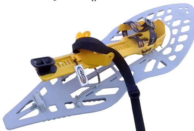
REF. 12MHRAQVUAB Fig. 1

MORPHOALP ULTRA LIGHT Snowshoe People between 60 and 96 kgs, UNISEX ALL TERRAINS, RENTAL www.morpho.tm.fr